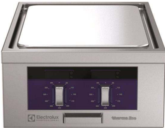
589126 (MCTAAAEAO) Electric Free-Cooking Top, one-side operated